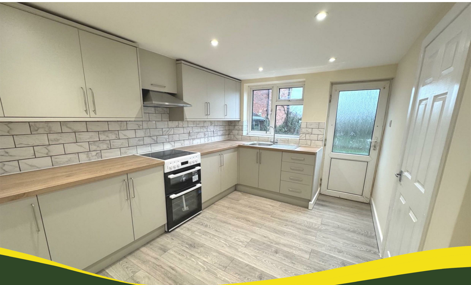
4 The Brickyard Burton-On-Trent